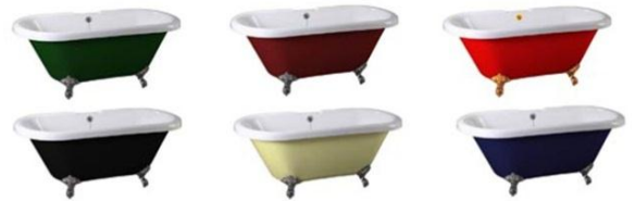
Requests may be for a single solid color, i.e. "Red," or a specific swatch number.