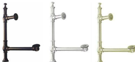
British Lever drains